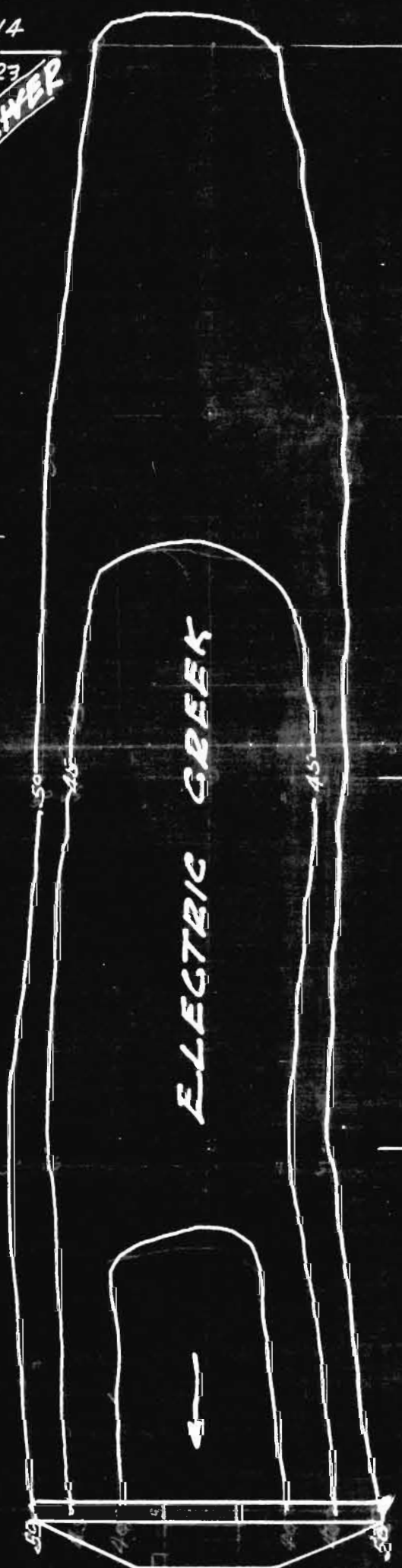
PLAN OF STORAGE SCALE 1"=20'