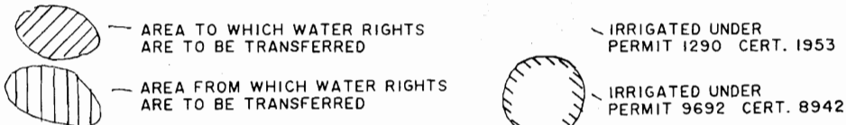
MAP SHOWING POINTS OF DIVERSION SCALE: 1" = 2640'