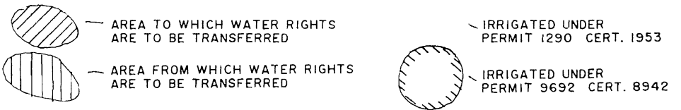
MAP SHOWING POINTS OF DIVERSION SCALE: 1" = 2640'