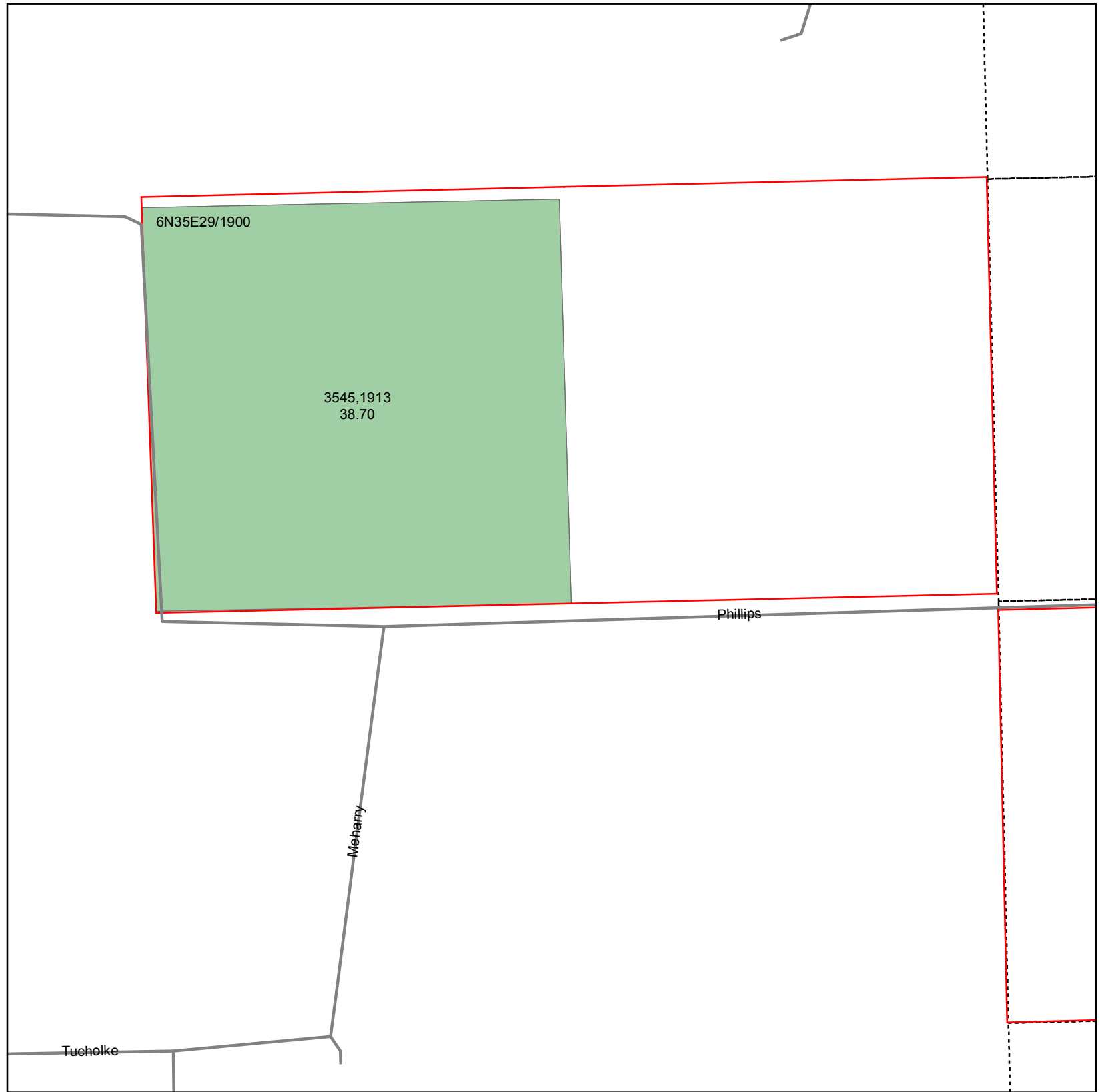
T6N R35E WM Section 29 SW Quarter