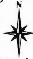
EXHIBIT A: CLAIM OF BENEFICIAL USE MAP FOR DKTK LLC TAX LOT 400 MAP 12S-3W-9 LINN COUNTY, OREGON NOVEMBER 2, 2018