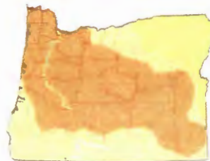
Drought Conditions: Percentages