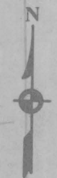
LOCATION PLAN SCALE: 1"=400'

EVALUATION BUILDING LOCATION PLAN & VICINITY MAP HOLMES & NARVER, INC.