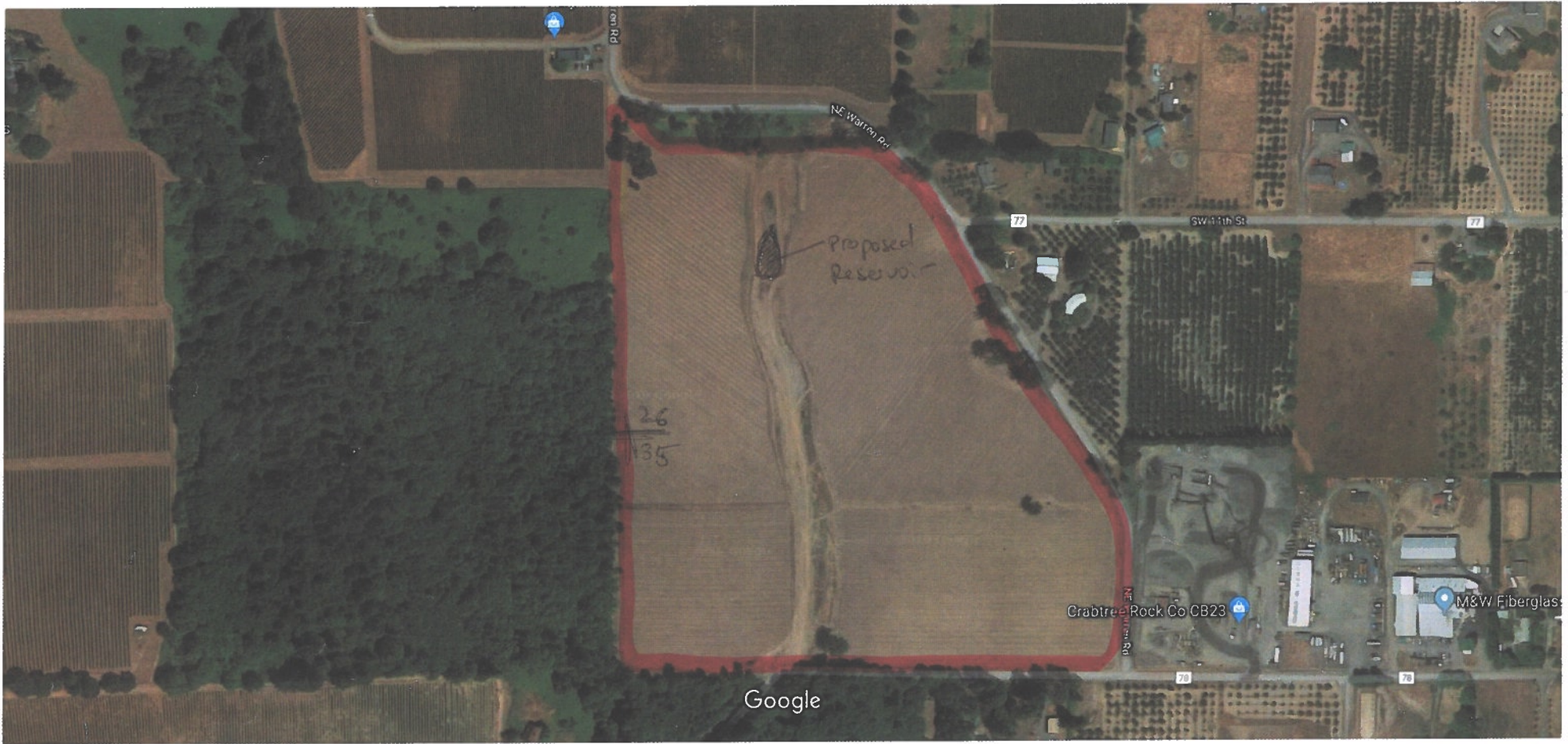
Imagery ©2019 Google, Map data ©2019 Google 200 ft