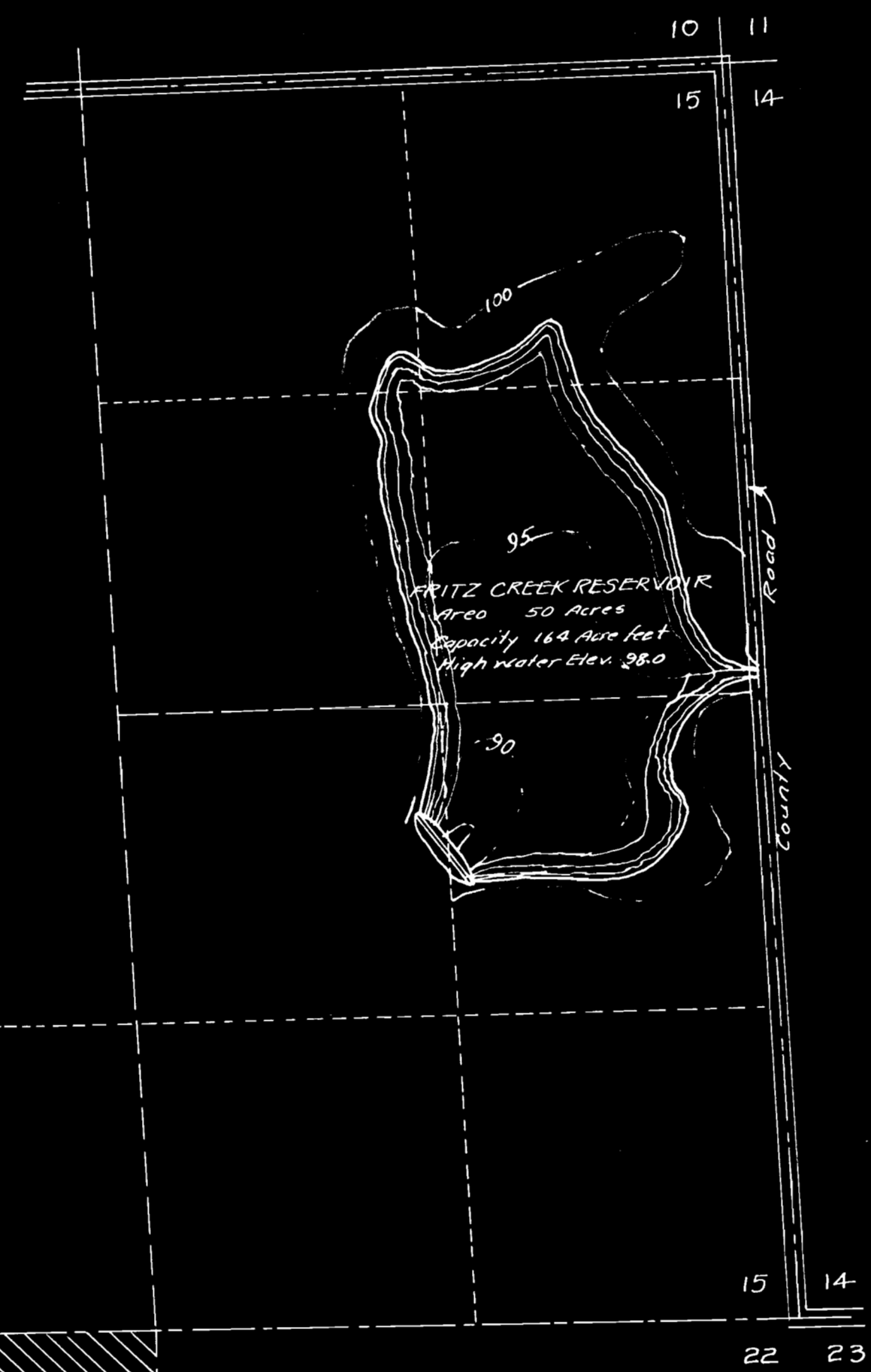
T. 36 S., R. 14 E., W.M.