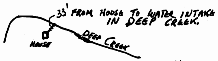
DETAIL OF HOUSE IN RELATION TO WATER INTAKE