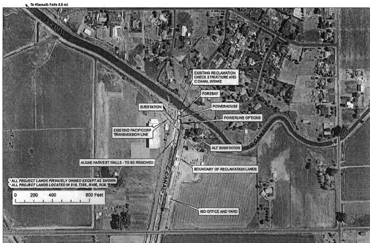
Figure 2. Proposed C-Drop Hydroelectric Project Site Area Map (Township 39 South, Range 10 East SW ¼ NE ¼ Section 19, W.M.)