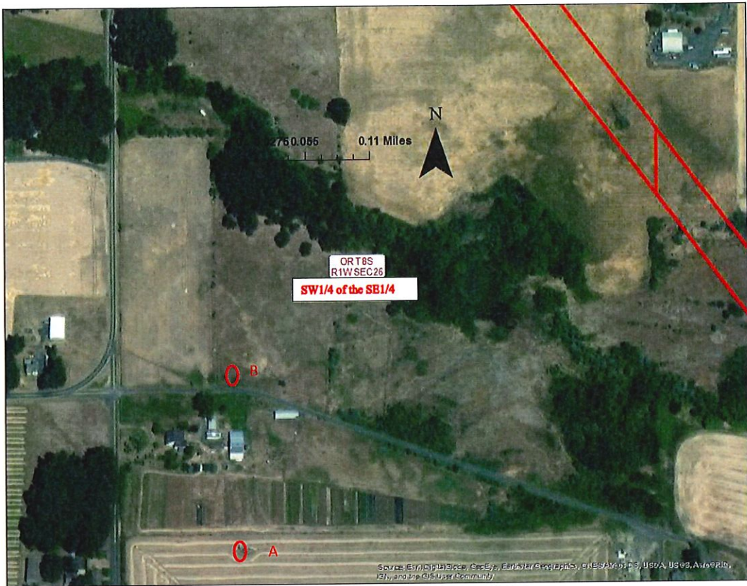
Figure 2. Expanded View of Wells A (current) and B proposed