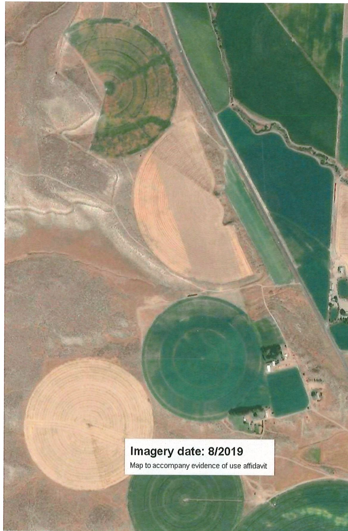
Imagery date: 8/2019 Map to accompany evidence of use affidavit