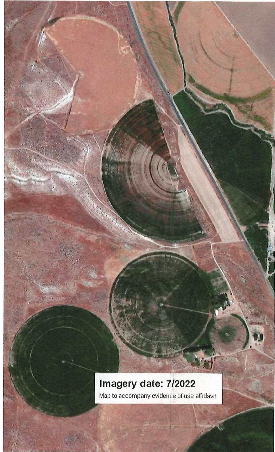
Imagery date: 7/2022 Map to accompany evidence of use affidavit