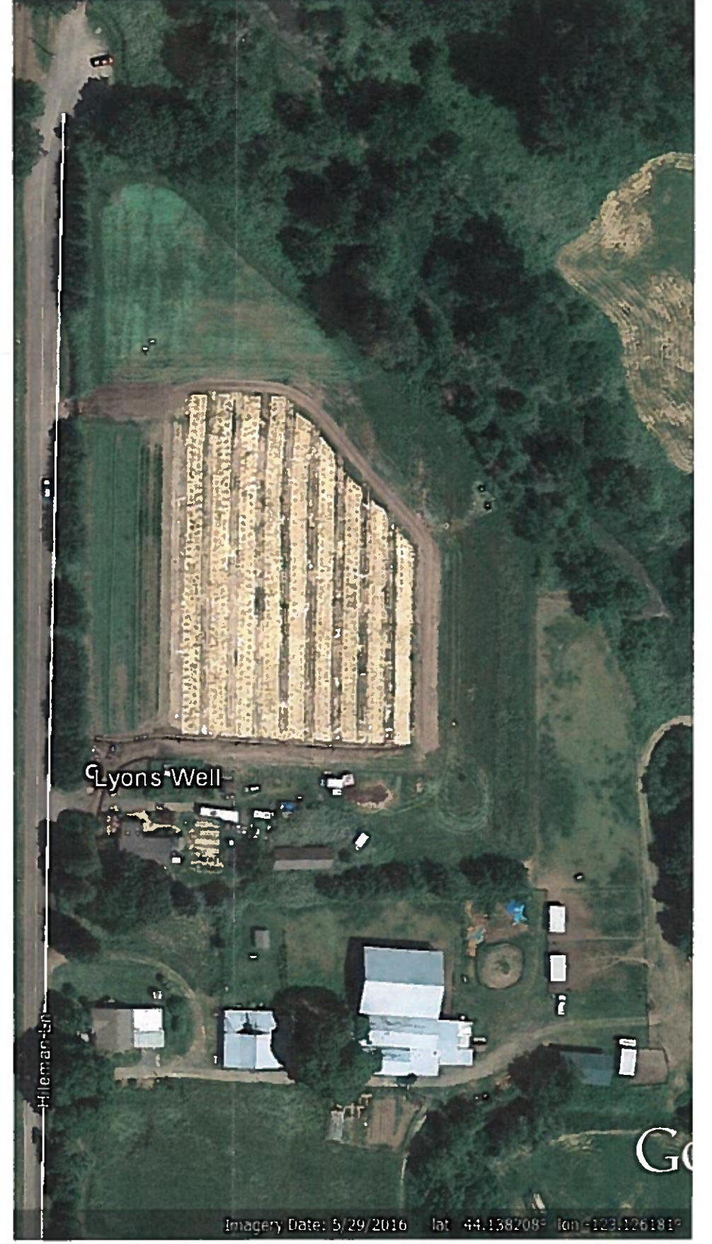
Google Earth Aerials