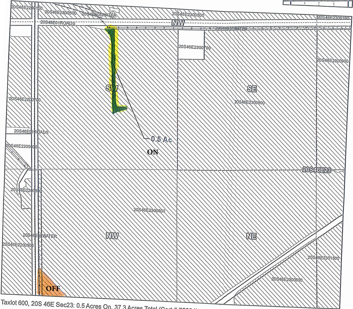
Taxlot 600, 20S 46E Sec23: 0.5 Acres On, 37.3 Acres Total (Cert # 75691)

Certificates: 75691 for Peterson, Alan & Tami