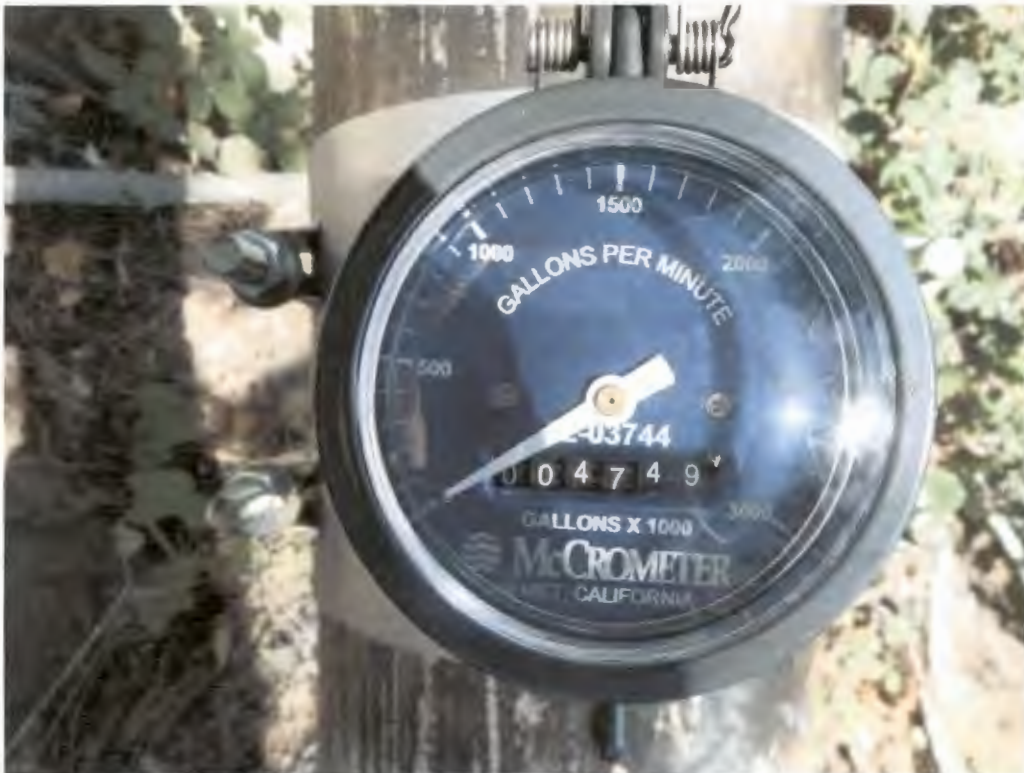
Meter No. 2 (Serial No. 22-03744-10)