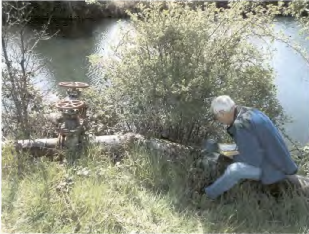
Meter No. 1 at "Steelhead Pond"