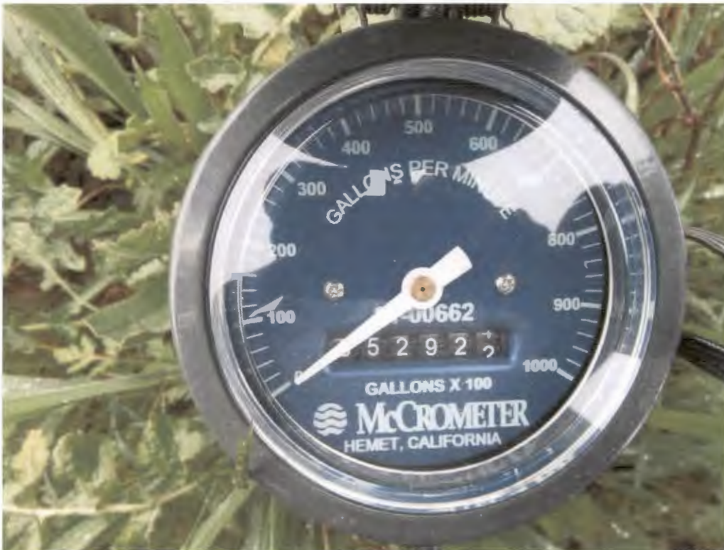
Meter No. 4 (Serial No. 21-00662-04)