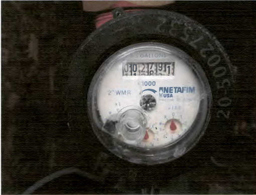
Meter No. 3 (Serial No. 20-50027532)