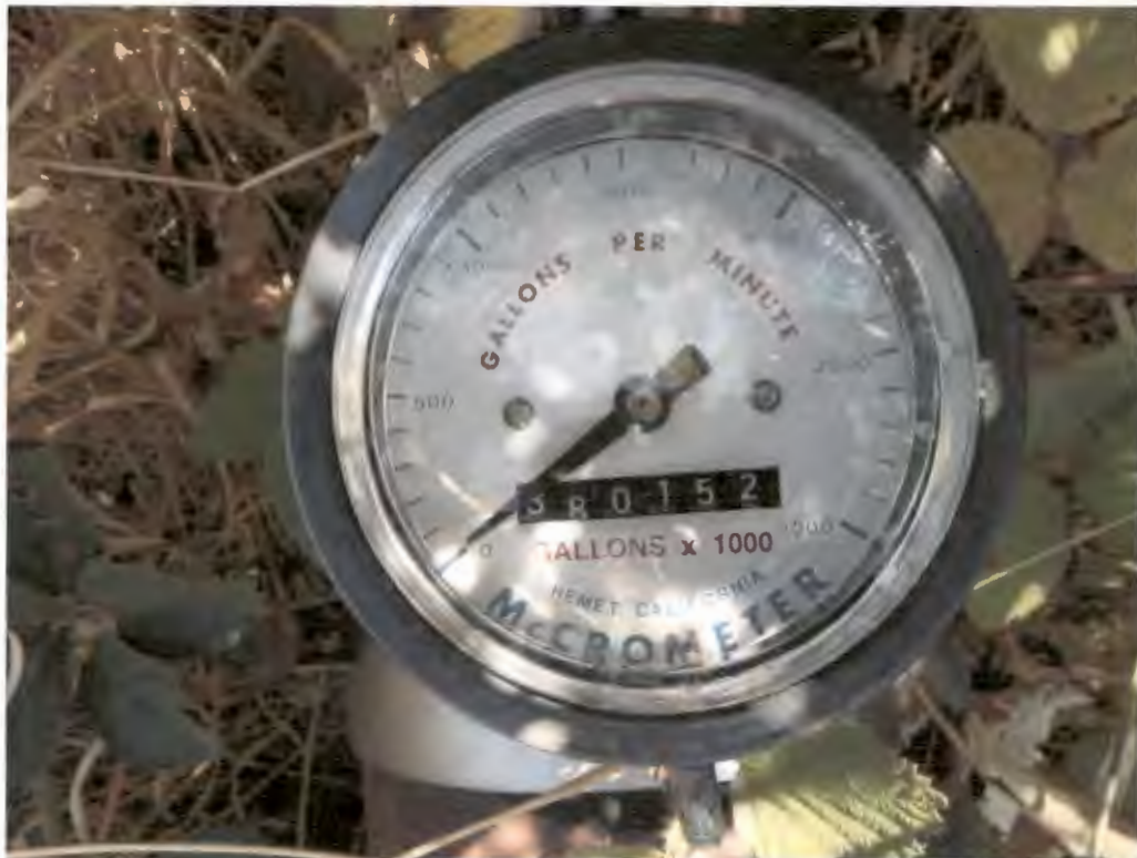
Meter No. 1 (Serial No. 01-07927-10)