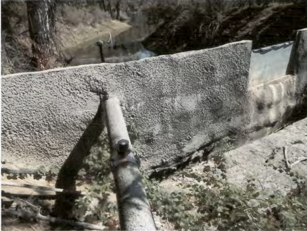
Meter No. 2 at Lippert Reservoir No. 2