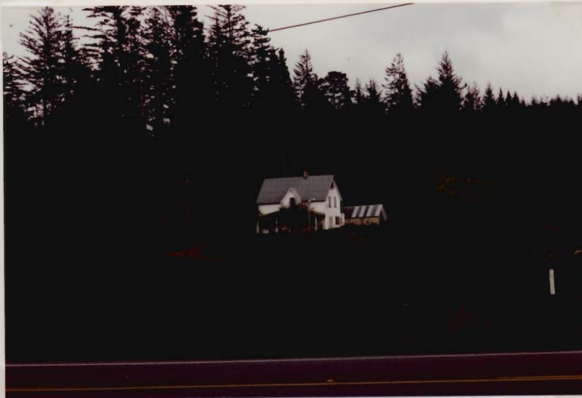
1992 PHOTO OF FARM HOUSE CONSTRUCTED IN 1900