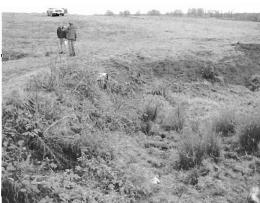
Photograph 2: South side of berm, looking east.

RECEIVED FEB 26 2009 WATER RESOURCES DEPT SALEM, OREGON