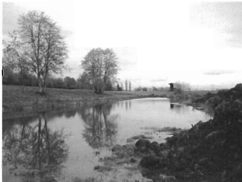
Photograph 4: View of pond from southeast corner, looking north.

RECEIVED FEB 26 2009 WATER RESOURCES DEPT SALEM, OREGON