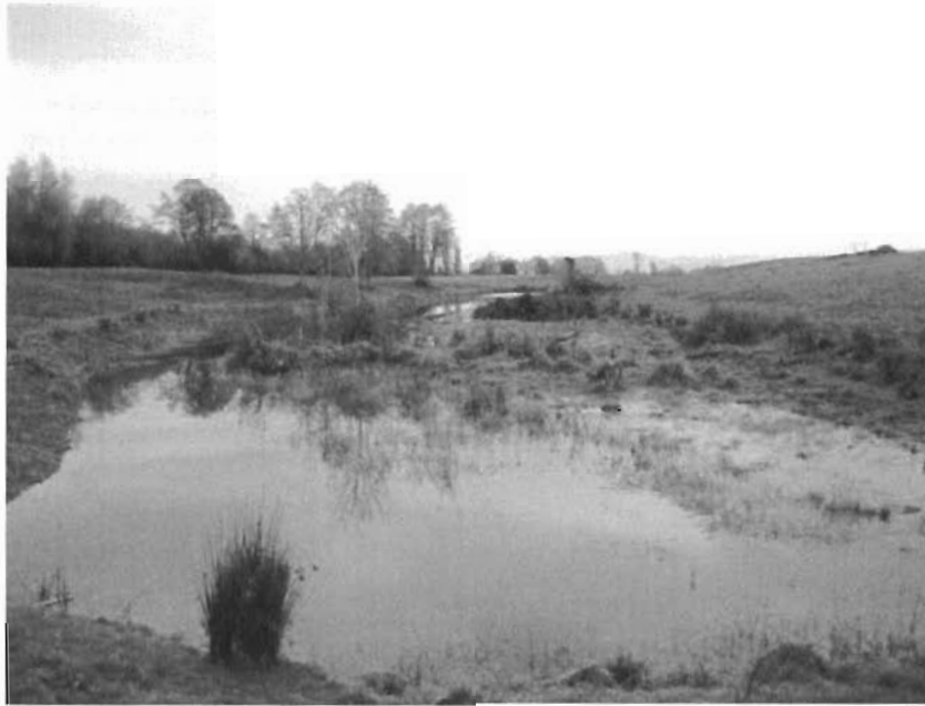
Photograph 3: View of pond from berm, looking north.