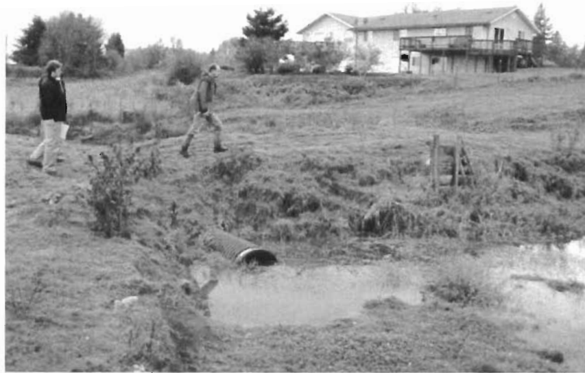
Photograph 1: North side of berm, looking south.