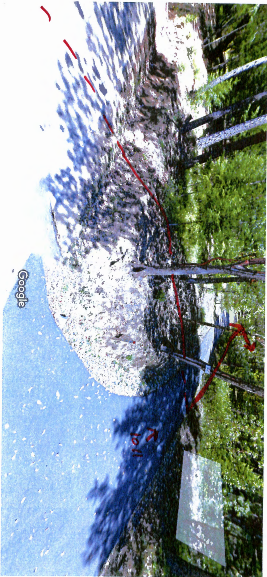
Grants Pass, Oregon Street View - Jun 2012