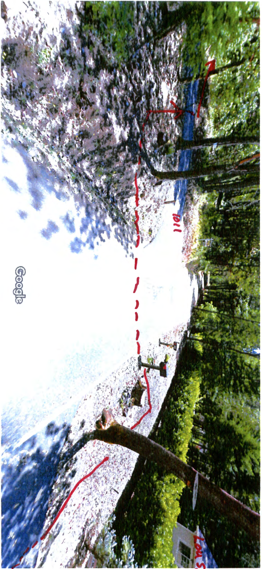
Grants Pass, Oregon Street View - Jun 2012