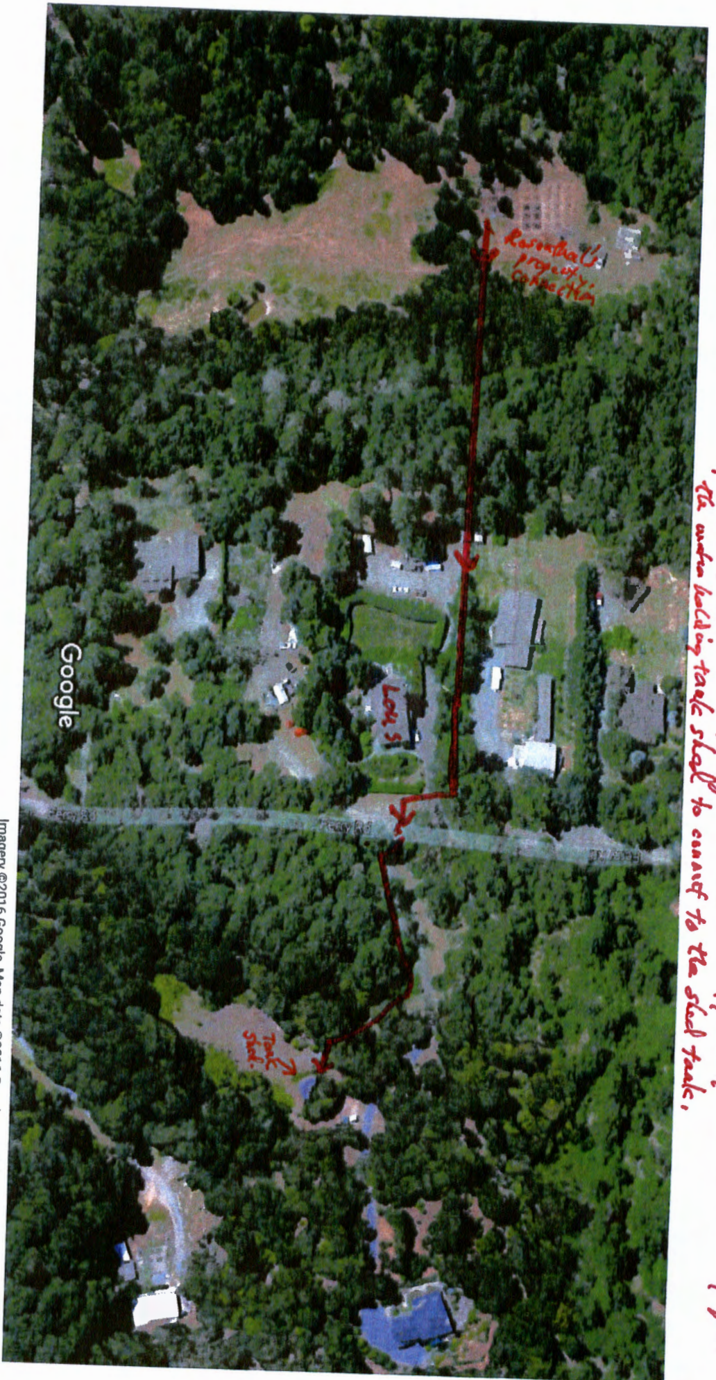
Imagery ©2016 Google, Map data ©2016 Google 100 ft

boreed water pipeline along the property line border of Lou Scogaro's property burrowed under Ferry Rd, across the bottom of "1011" driveway and then up the right side of the thin driveway granite dirt driveway, crossing under the driveway up at the water holding tank stand to connect to the steel tank.