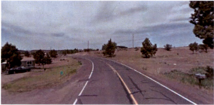
800 Grizzly Rd Madras, OR 97741