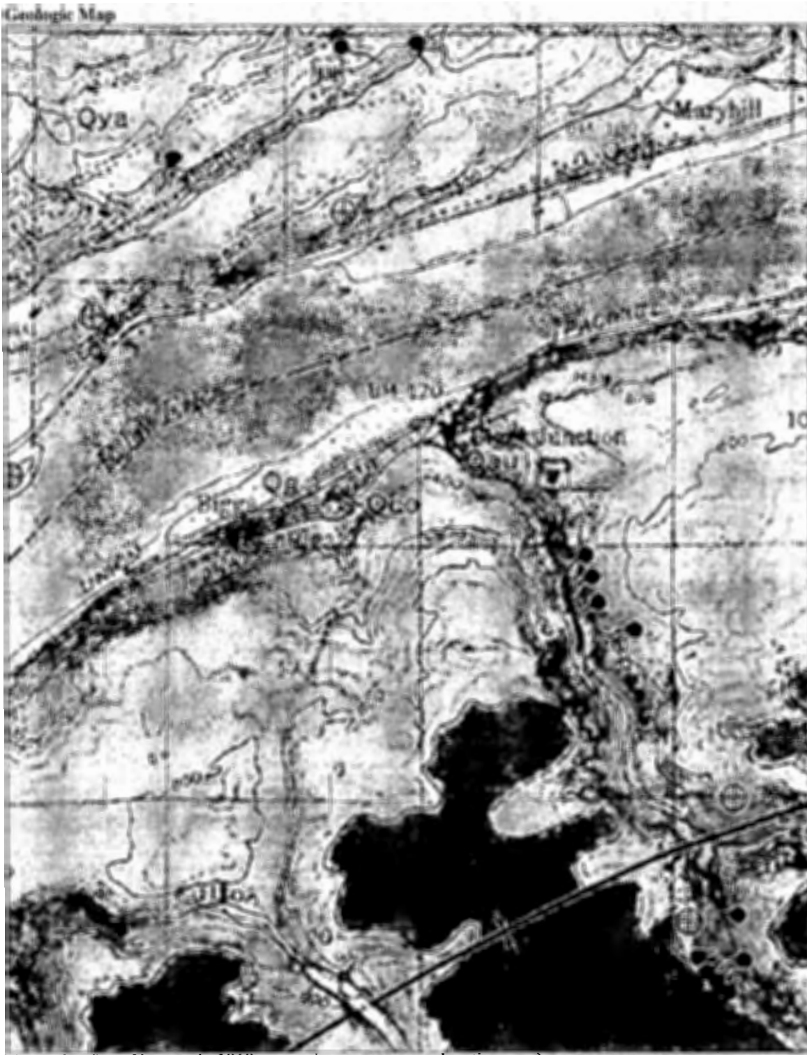
(screenshot from Newcomb, 1969 – covering same area as location map).