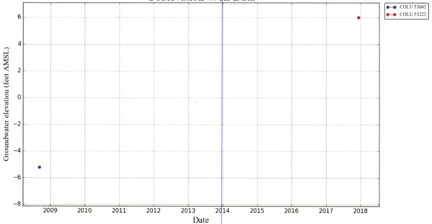
Observation Well Data