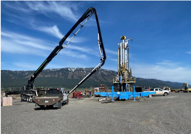
Irrigation well abandonment in eastern Oregon