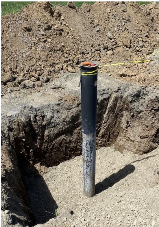
Well seal damaged during pitless adapter installation