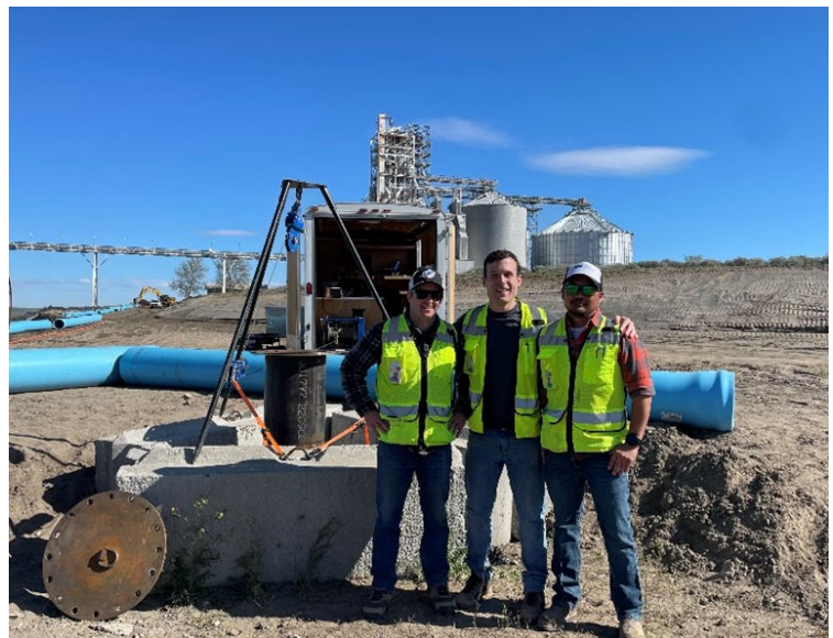
Well inspectors at training event in NC Oregon