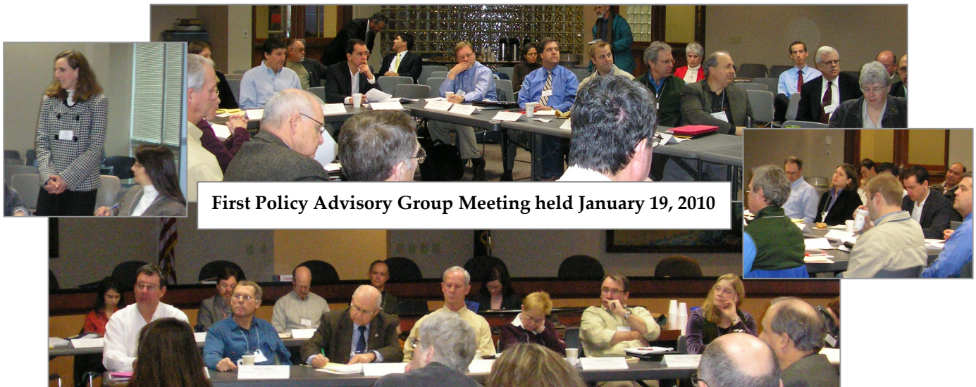
First Policy Advisory Group Meeting held January 19, 2010