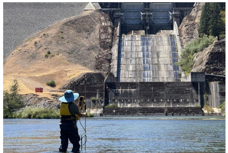
Measurement on the Applegate River