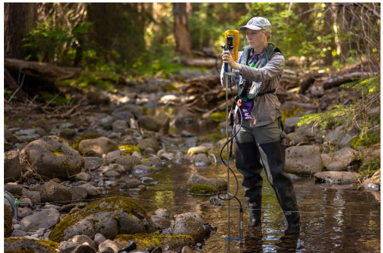
Streamflow measurement in Klamath Basin