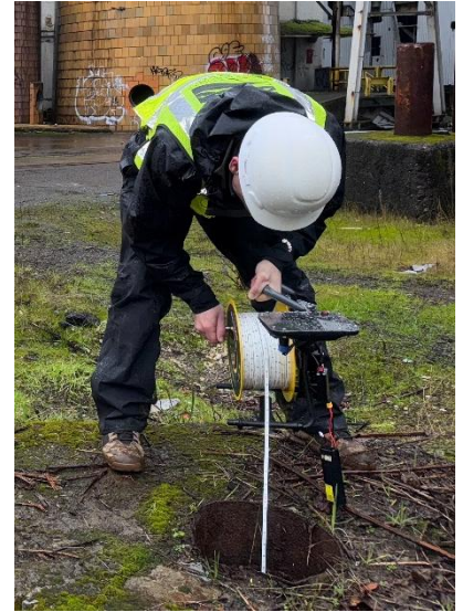
Well inspection in Northwest Region