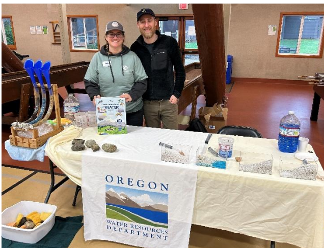
Community event in Tillamook