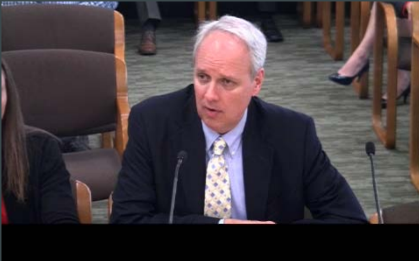
Senate Committee On Environment and Natural Reso...