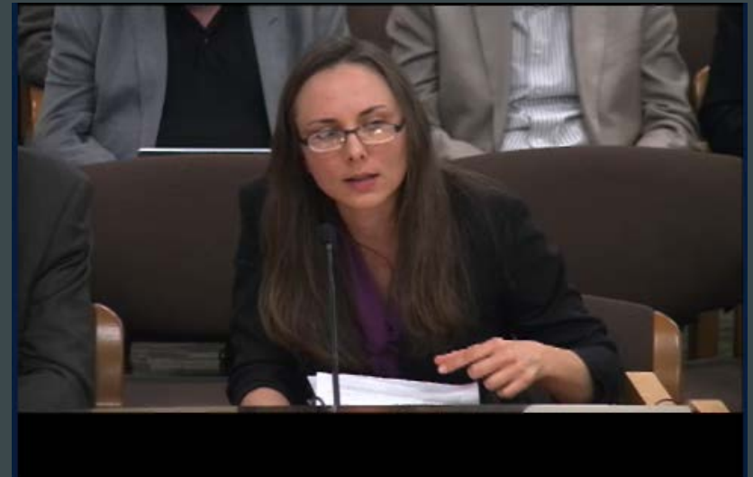
House Committee On Rural Communities, Land Use, ...