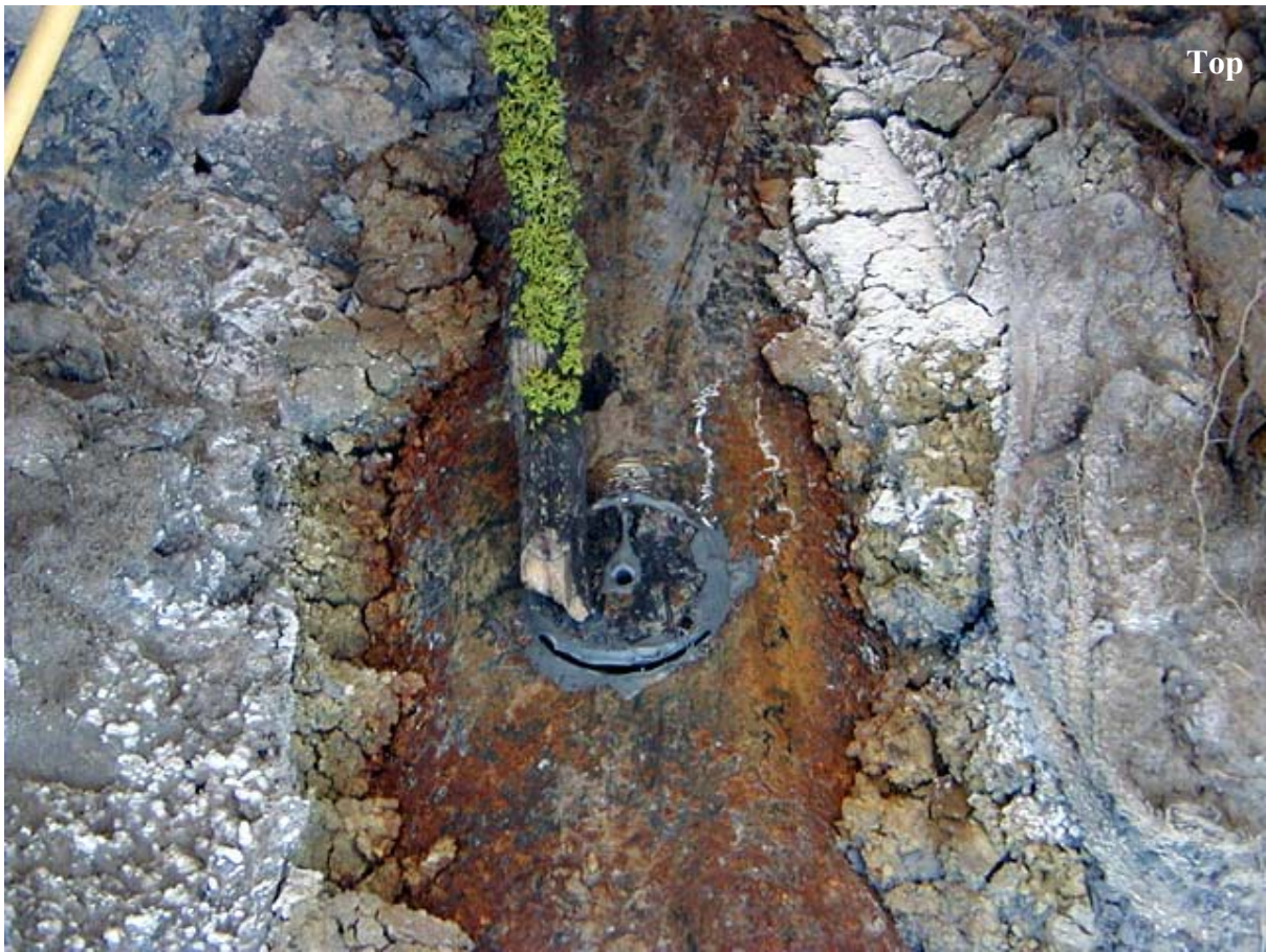
Hole was cut in casing to place pitless adaptor and then glued back together.