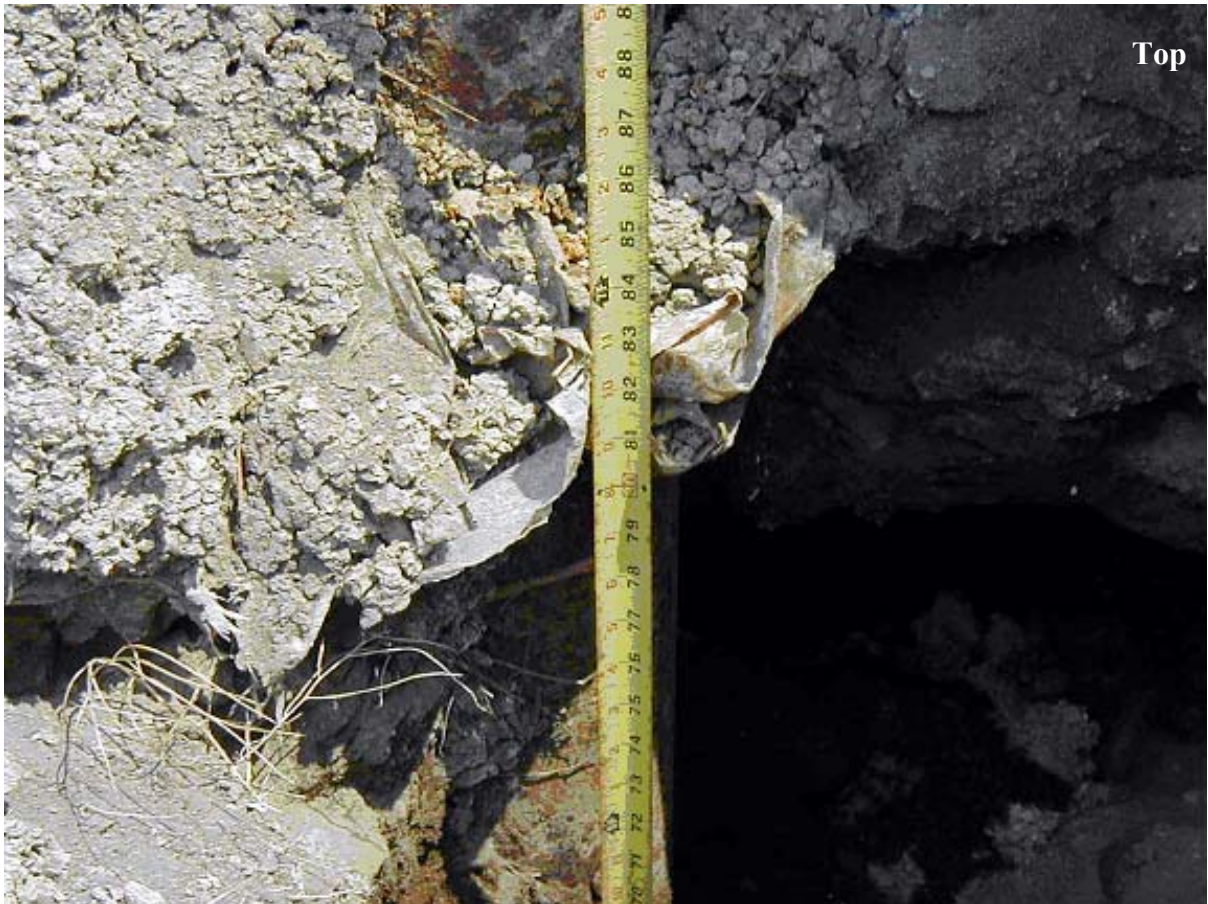
Picture taken to show depth below the plastic tarp that I was able to run my tape down along the casing in the annular space after probing along side of the casing.