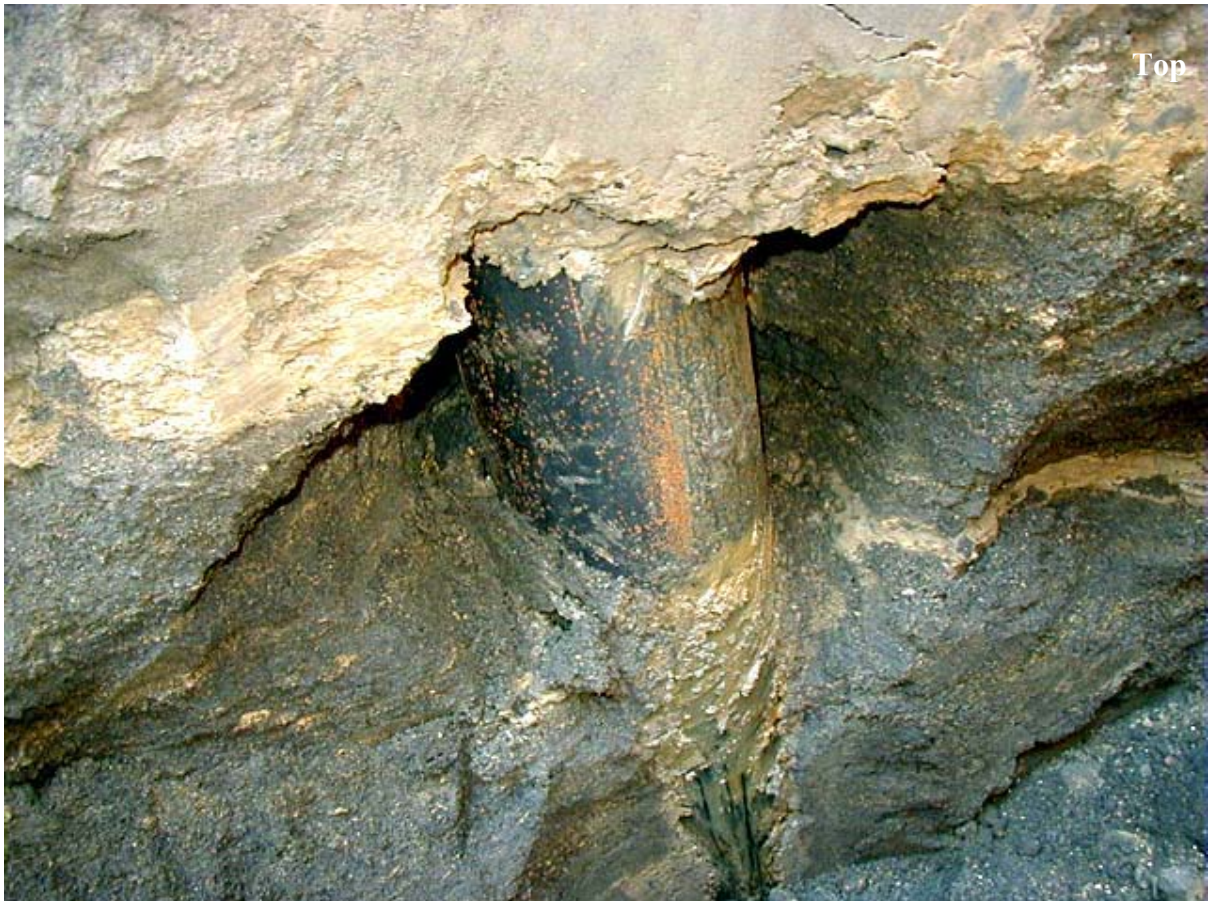
Well dug with backhoe. When well was completed, driller back-filled pit without the benefit of a surface seal. Well casing did not meet standard.