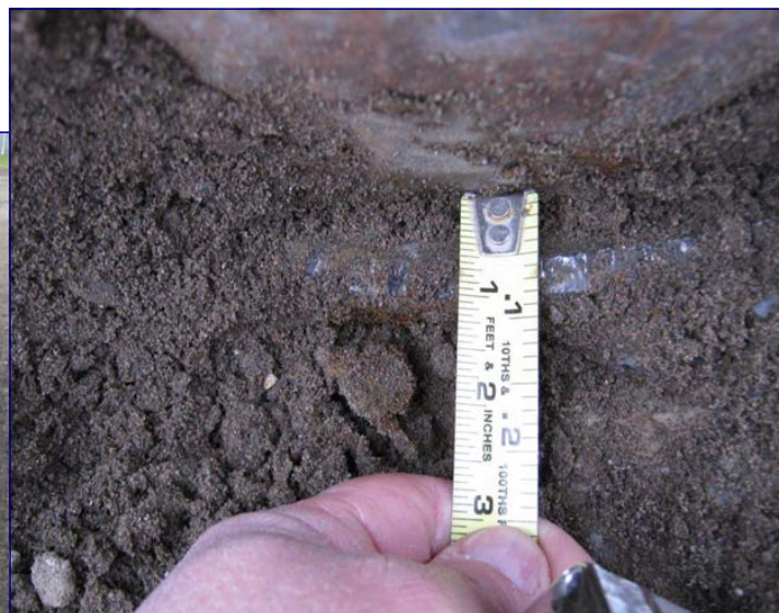
Temporary casing left in the ground.