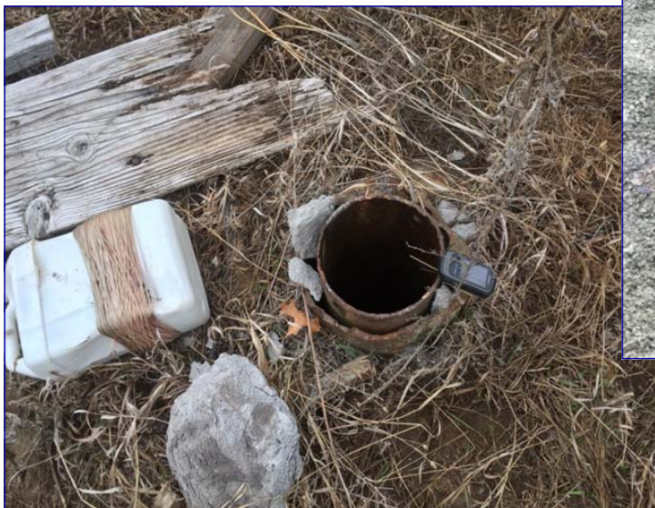
Improperly decommissioned well.