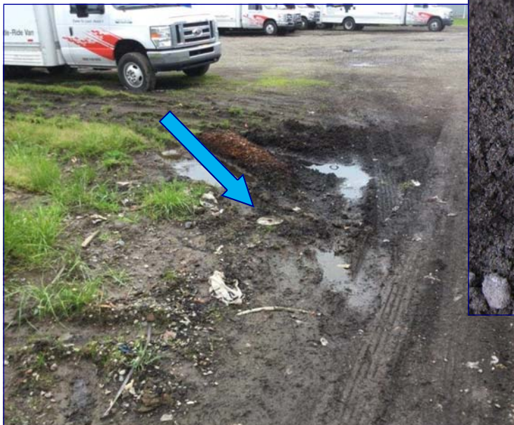
Water supply well in a parking lot.