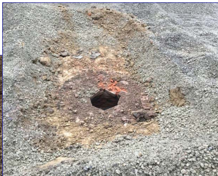
Uncovered dug well on a construction site.