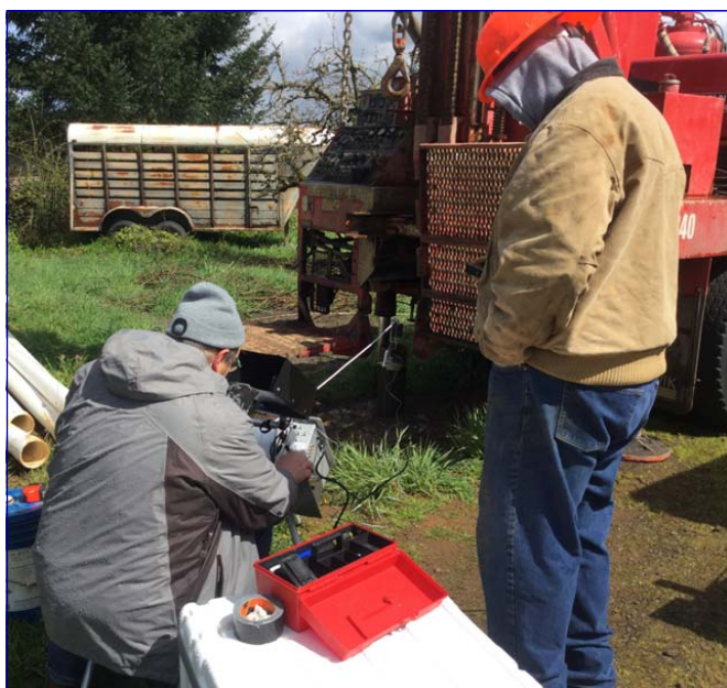
Water Resources Department staff performing a down-hole video inspection of a well.