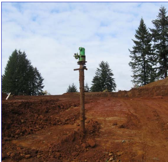
A construction site with an old cased well to be abandoned.