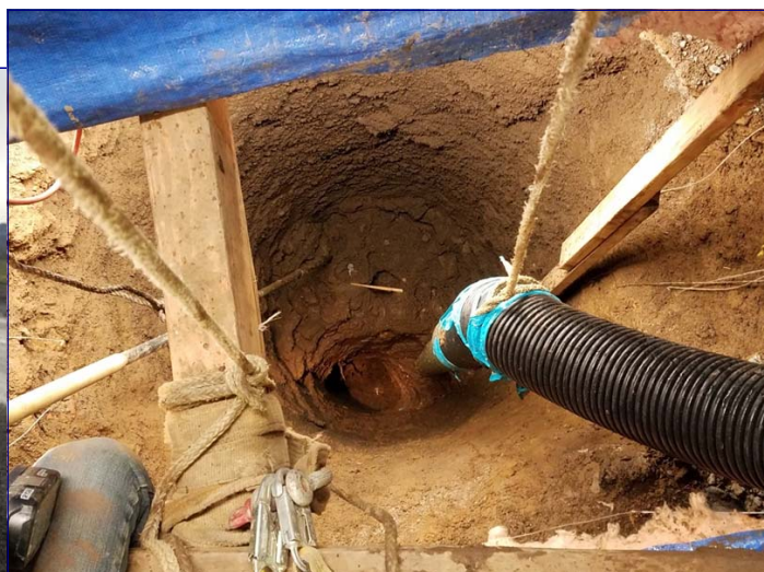
A dug well to be abandoned is cleaned out with a vacuum truck.