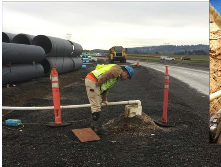
A dewatering well located on a construction site.