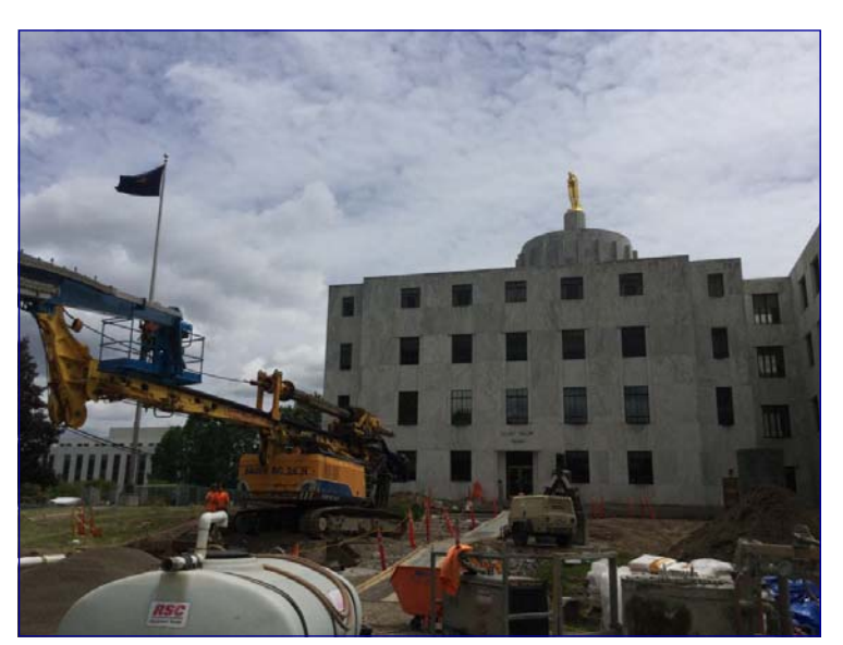
Preparing to drill dewatering wells.