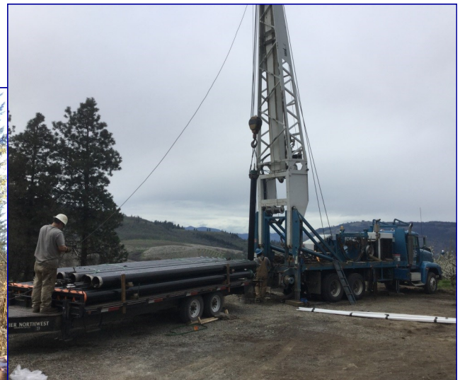
Preparing to set casing in Eastern Oregon.