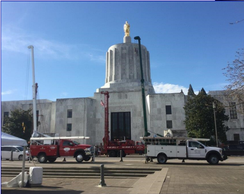
Groundwater Day at the Oregon State Capitol