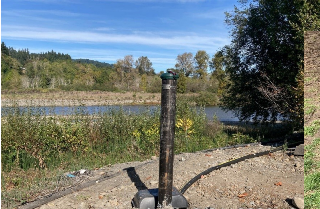
A well that was constructed to allow for seasonal high water level.