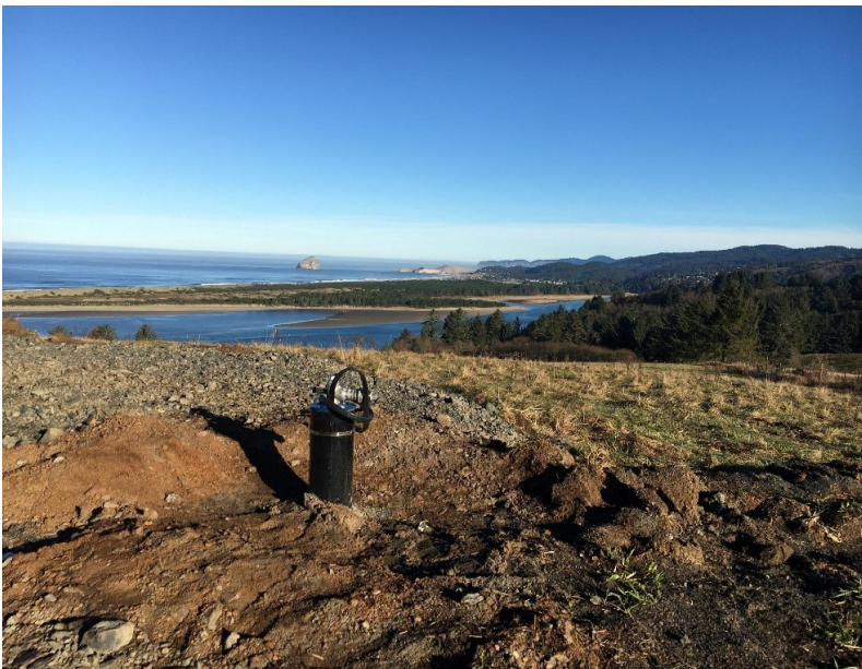
A new water supply well at the coast.