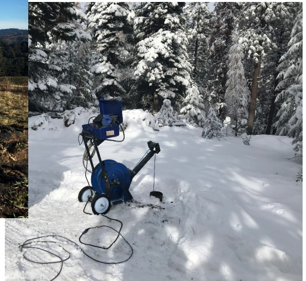
Running a down-hole camera in the snow in Eastern Oregon.