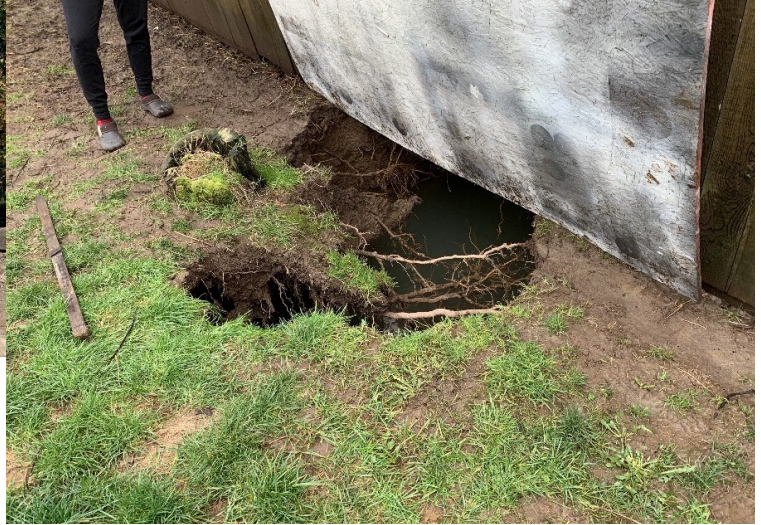
An old dug well that has collapsed.