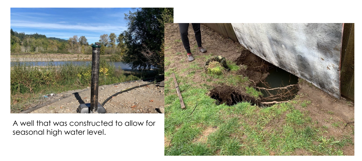
An old dug well that has collapsed.