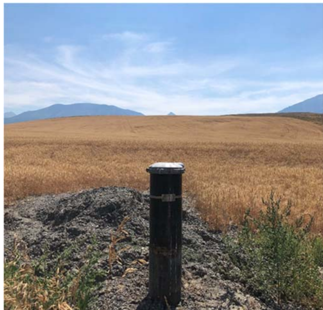
Newly constructed well in Eastern Oregon