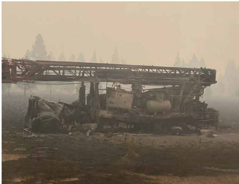
Southern Oregon wildfire destroys drilling rig