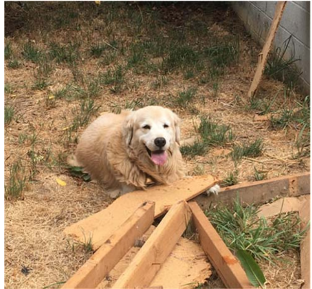
Calvin –Survived 20ft fall into a dug well

In the Identify tool, there is a new tab called Geology: