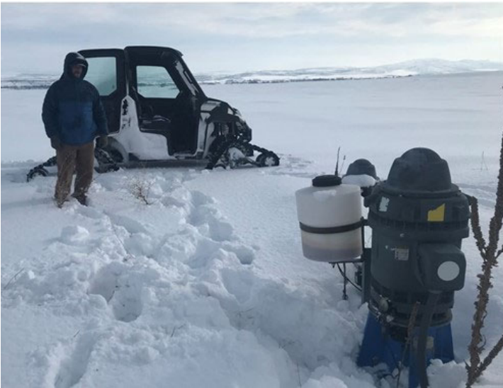
E Region observation well measurement