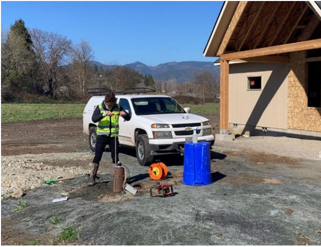
SW Region Staff inspecting a well