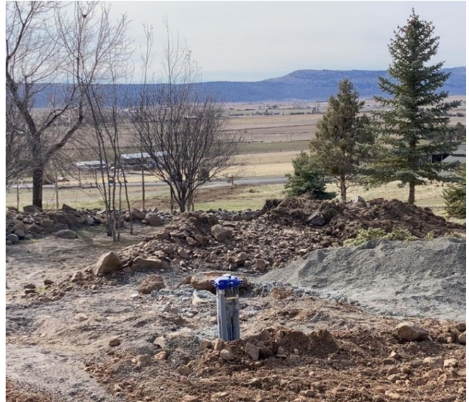
New well in the Klamath area